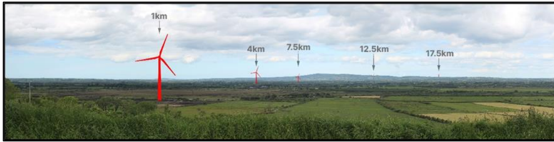
Figure 1-1: Effect of Distance on the Visibility of Wind Turbines (illustrative purposes only).

provides an illustration of the differences in view relative to the distance of the viewer from the turbine; in this illustrative example, all turbines shown in the image would be considered ‘visible’ in the ZTV map, though they have differing magnitudes of visibility: